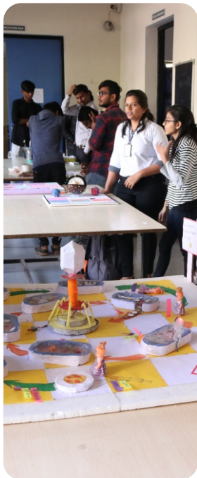
Young Science Conclave