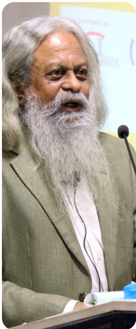
NCRIS National Conference