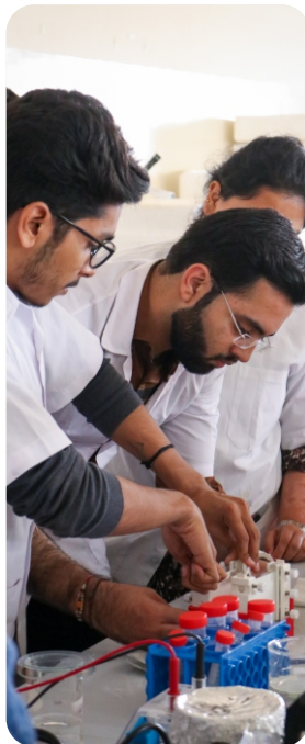
Molecular Biology & Immunology Workshop