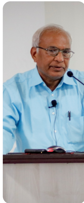
Interpretation of 2D-NMR